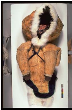
coat CD95-655 S92-3737