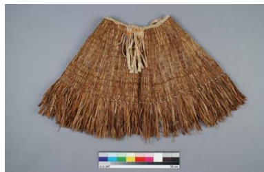
cape CD2003-1069 D2003-08497