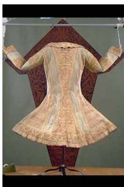
coat CD94-685 S89-1745