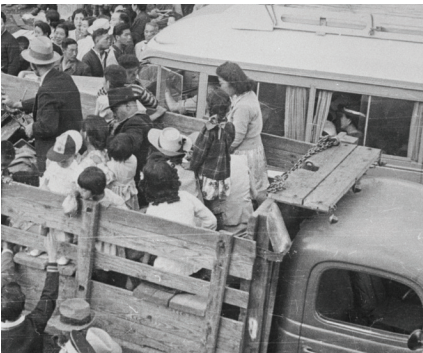
▲ Group of Japanese Canadians being transported to camp at Slocan, British Columbia, 1942

Lost Liberties probes the crises that drove these tragic events, and features poignant first-hand accounts from the men, women and children who lived through them.