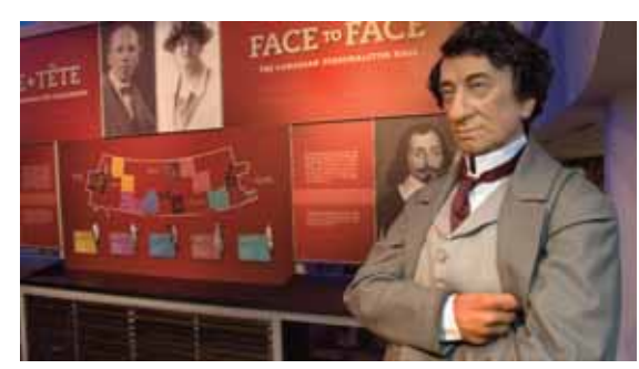
Face to Face: The Canadian Personalities Hall