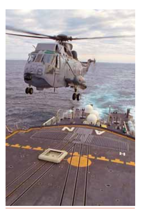
IMAX 3D Rescue

The Corporation's National Collection Fund , launched in 2006, assists in the acquisition of artifacts and demonstrates its own commitment to its fundraising activities. The Corporation is allocating $1 million per year