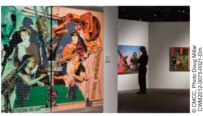
Temporary exhibition - A Brush with War: Military Art from Korea to Afghanistan

Corporation looks forward to continuing to preserve and promote Canada's remarkable heritage.