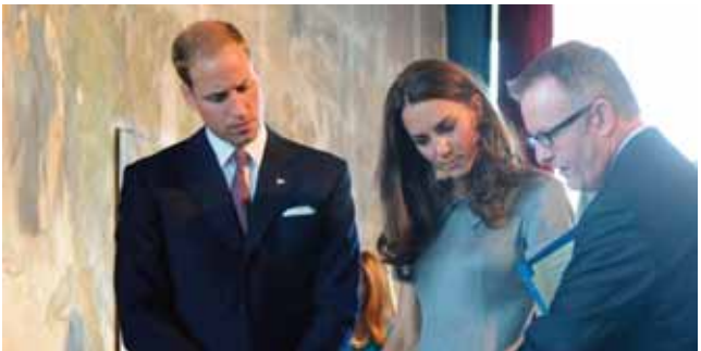
DSC 1952/DCS 1969