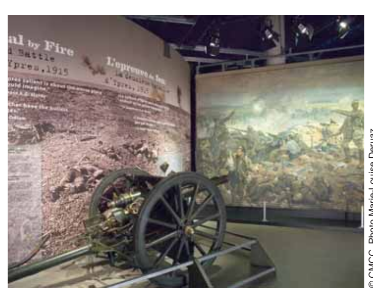
For Crown and Country, Gallery 2

The War Museum is Canada's National Museum of military history and it welcomes an average of 470,000 visitors a year. Its exhibitions and public programs help Canadians understand their military history in its personal, national and international dimensions. It emphasizes the human experience of war to explain the impact of organized conflict on Canada and Canadians and describes how, through conflict and peace support operations, Canadians have influenced the world around them. It also houses the Military History Research Centre, a vast collection of Canadian war art, and one of the world's finest collections of military vehicles and artillery.