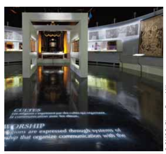
Temporary Exhibition - God(s): A User's Guide

The Museum of Civilization facility in Gatineau, Quebec has been open to the public for 22 years. The War Museum in Ottawa, Ontario has been open to the public for six years. Both facilities are heavily used, thus requiring substantial and continuous capital repairs to ensure the operation and maintenance of their