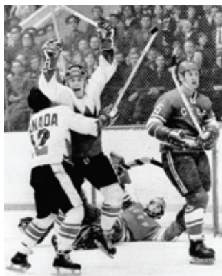
Henderson's Goal, 1972

Paul Henderson scores the winning goal in the 1972 Summit Series. A little boy runs after his father marching off to war. Terry Fox is silhouetted by headlights of a police cruiser on his Marathon of Hope. Exploring unforgettable moments in our history, the indoor travelling exhibition