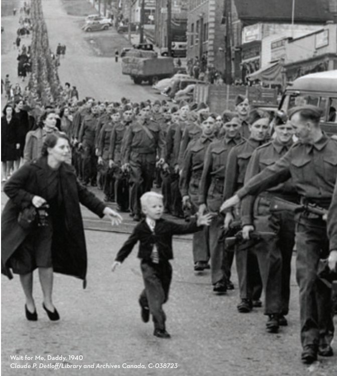
Wait for Me, Daddy, 1940