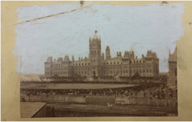
Photo by Elihu Spencer showing the crowd on Parliament Hill on July 1, 1867. Bytown Museum / P2887