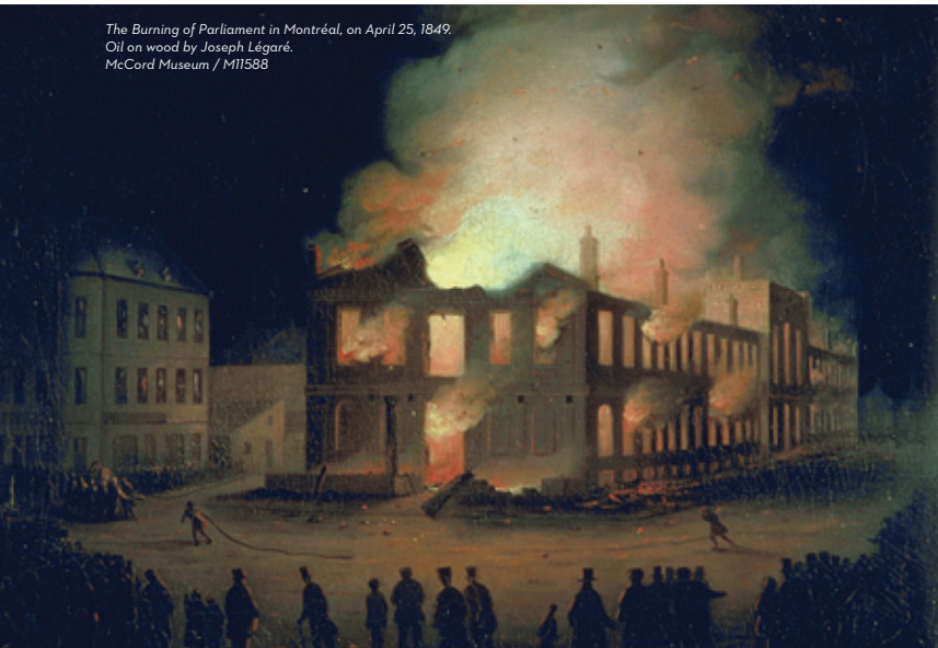
The Burning of Parliament in Montréal, on April 25, 1849. Oil on wood by Joseph Légaré. McCord Museum / M11588

Informative graphic panels and videos will take visitors through the struggle for responsible government and the debates and negotiations that led to Confederation during a time of social upheavals. Also included in the exhibition is a quiz game to help visitors discover the British North America Act of 1867 and its 147 articles, which define the foundations of the new Dominion of Canada.